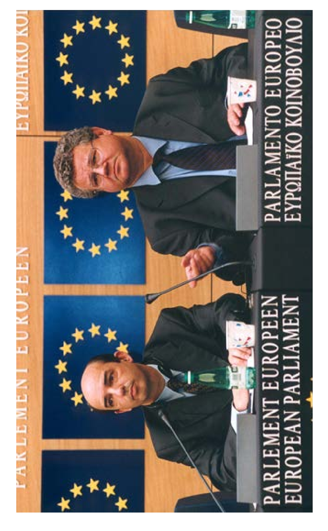
Carlos Coelho and Gerhard Schmid at the press conference on 11 July 2001.