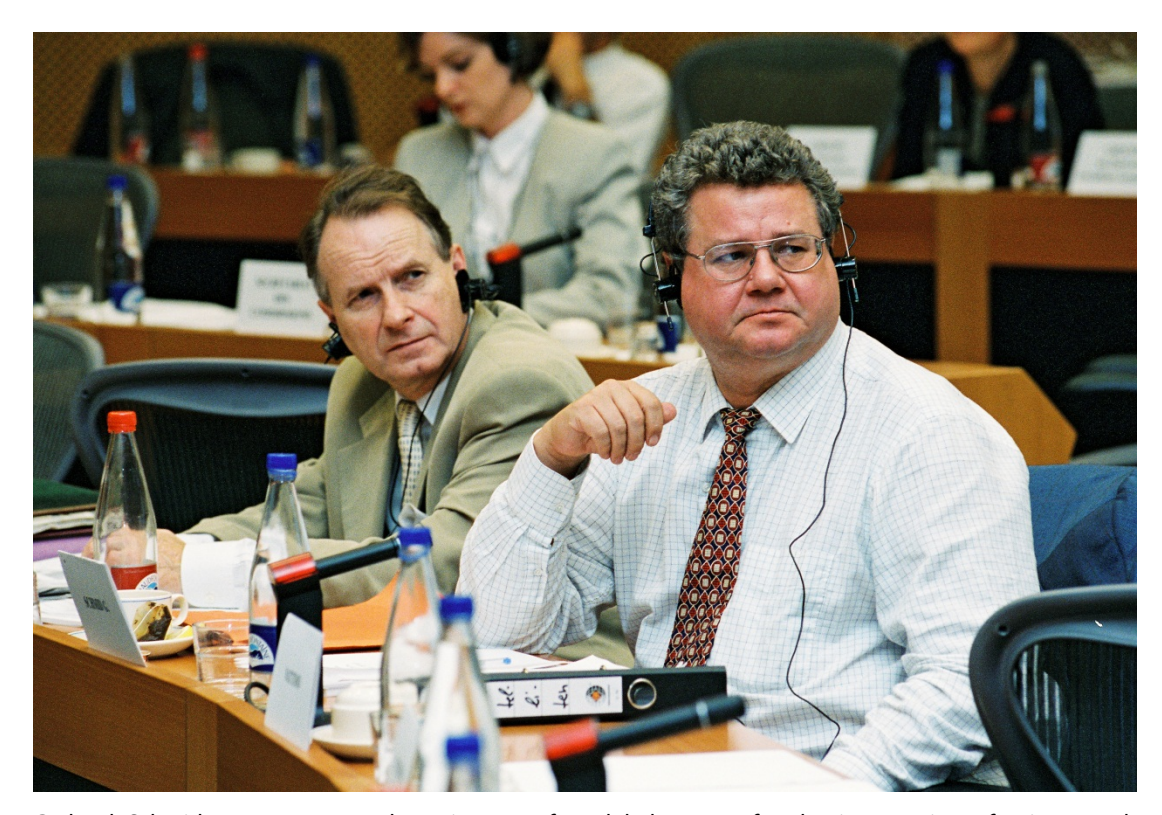
Gerhard Schmid, rapporteur on the existence of a global system for the interception of private and commercial communications (Echelon interception system) (Document A5-0264/2001), at the committee meeting of 12 October 2000. On the left, Reino Paasilinna, member of the te mporary committee.

The report is accompanied by 44 recommendations on various matters. Almost all of these also feature in the motion for a resolution and in the resolution as adopted. Of the recommendations not included in the resolution the most important was No 16, which – logically in accordance with the principle of Member State responsibility under Article 10 TEC as interpreted in the report with reference to industrial espionage – called on the authorities of the United Kingdom [...] to explain their role in the UK/USA alliance in connection with the existence of a system of the 'Echelon' type and its use for the purposes of industrial espionage. This is the only place where the report, albeit cautiously, reminds the UK of its accountability<sup>62</sup>.