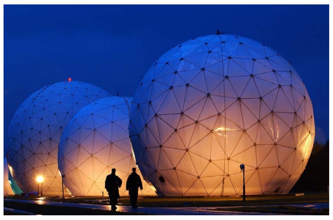
'Radomes' at the encryption operations centre, Misawa airbase, Japan. The portmanteau word 'radome' is derived from 'radar' and 'dome' and describes a weatherproof enclosure that protects an antenna.