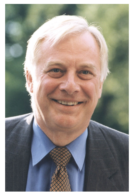
Christopher Patten, Commissioner for External Relations, who took part in a hearing with the Echelon Committee on 3 April 2001.

Commissioner Patten stated that, although the activities of the US intelligence services were not part of the New Transatlantic Agenda, the issue of Echelon was to be addressed at a meeting of justice and home affairs ministers. As regards the more specific issue of information security, Mr Patten said that, following the approval of the Council regulation on security, the Commission was in the process of approving its own regulation which would lay down detailed arrangements for the processing of the various forms of classified EU information and afford the Commission a level of security commensurate with its role in the context of the CFSP and the ESDP<sup>46</sup>. At least some of the members of the committee were dissatisfied with Mr Patten's answers in particular.