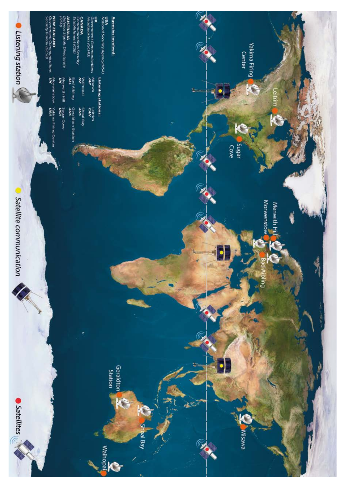
A global electronic surveillance system: Echelon eavesdrops on all e-mail, telephone, fax and telex transmissions carried by satellite worldwide.