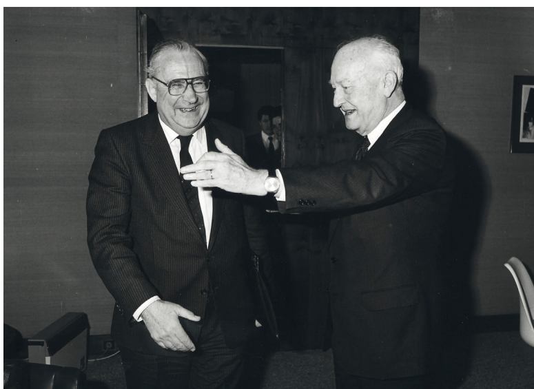
Irish senator James Dooge meeting with Pierre Pflimlin, the President of the European Parliament, on 18 April 1985 to discuss the Dooge Committee's progress.

The EP at least scored a procedural victory (albeit with unpredictable consequences) when the member states decided at the Fontainebleau summit in June 1984 to set up a committee to discuss EC reform. At his press conference, Mitterrand explained that the committee would work 'in close cooperation with the Commission, which will participate in its work', and in consultation with the EP which 'will be informed continuously through the intermediary of its president and Bureau'. 142 This committee was commonly referred to as the Dooge Committee, named after Irish senator James Dooge, who chaired it when it started its work during the Irish EC presidency. It was also sometimes called Spaak II in an allusion to the committee named after the Belgian foreign minister Paul-Henri Spaak, which had discussed proposals for further sector integration and a customs union in 1955 in preparation of the intergovernmental negotiations that then led to the signing of the Rome treaties in March 1957. In 1984, Mitterrand's initiative for such a committee composed of personal representatives of the member state heads of state and government formed an essential part of a larger compromise which included the decision on the British budget rebate.