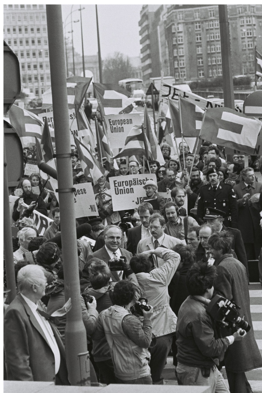
Upon becoming chancellor in 1982, Helmut Kohl gave German European policy new purpose and direction, strongly supporting the European Community's institutional deepening.

the German candidates showed high support for giving the EP full budgetary powers and expanding the EC's policy scope, followed by the EC's parliamentarization as a less urgent demand. 40