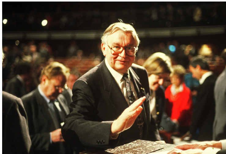
A key power broker in the European Parliament, Egon Klepsch, the long-time leader of the European People's Party Group, helped Altiero Spinelli overcome resistance to his role among Christian Democrats.