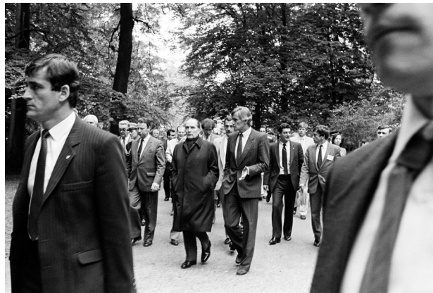
Here in conversation with Piet Dankert, President of the European Parliament, François Mitterrand endorsed the objectives of the Draft Treaty on European Union in broad terms in his speech to the EP on 24 May 1984.

When the EP passed the DTEU in February 1984, most of its supporters realized that, if they decided to proceed with EC reform, the member states would probably take recourse to the established legal mechanism for treaty reform: convening an IGC. They did hope, however, that the DTEU, despite its compromise character, would push the boundaries of thinkable constitutional options for the EC, and that the threat of its possible ratification by national parliaments would exert pressure on the governments. After all, EC constitutionalization was an 'unpredictable process'. 141 Changing structural circumstances such as national election outcomes and shifting member state preferences, for example, could conceivably create a window of opportunity for more far-reaching reform. Moreover, the EP majority expected pressure on the member states to grow during the forthcoming campaign for the second direct elections in June 1984 which pro-integration parties would fight under the DTEU banner.