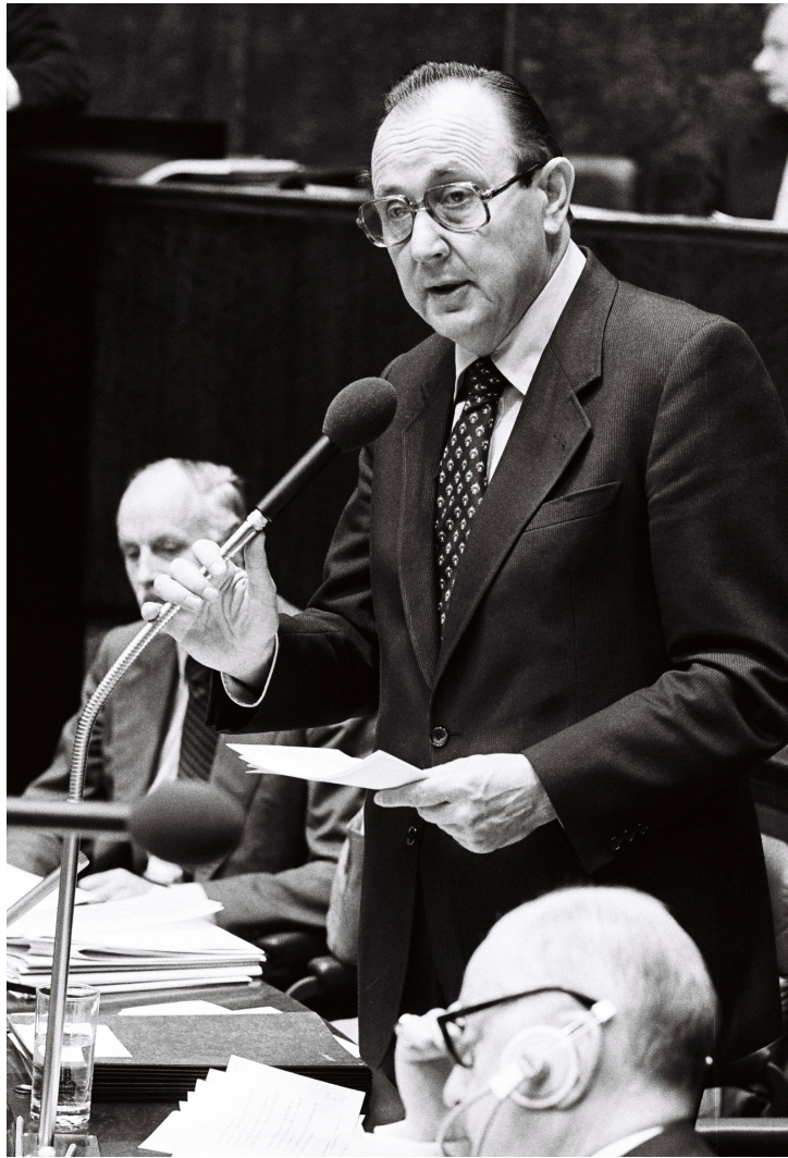
The German liberal foreign minister Hans-Dietrich Genscher presenting the Genscher-Colombo initiative to the European Parliament on 19 November 1981.

The member state governments largely ignored such procedural issues as politically irrelevant and to be left to the Council administration. They were more concerned with political fire-fighting, from the steel crisis to coordinating a European position on NATO's dual-track decision about the stationing of middle-range nuclear missiles. They saw no real scope for a major constitutional overhaul of the EC and instead followed their own policy of small steps. This is especially true of the 1981 Genscher-Colombo initiative which eventually led to the so-called Solemn Declaration at the EC summit in Stuttgart in June 1983. On 6 January 1981, Genscher, the German liberal foreign minister, gave a speech at his party's traditional January conference in the federal state of Baden-Württemberg, suggesting renewed efforts to achieve a European Union of sorts. 105 Genscher subsequently met several times with Emilio Colombo, the Italian foreign minister and former EP president during 1977-79, before the two foreign ministries developed a concept for a 'Single