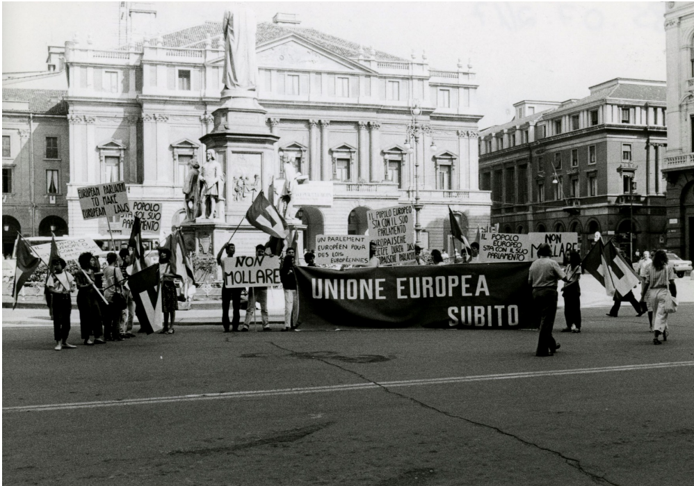
Lobbying for greater European integration at the Milan summit in 1985: European federalists still exercised influence through tight political networks, especially in Italian politics, which they used to lobby for a European constitution.

Crucially, Delors, on becoming Commission President, quickly connected the demand for further economic integration to proposals for institutional reform and especially majority voting to prevent blockages in the Council that could impede the abolition of non-tariff barriers. As a chair of the EP's Committee on Economic and Monetary Affairs during 1979-81 and French Economics and Finance Minister during 1981-84, Delors was acutely aware of the growing importance of non-tariff barriers for impeding trade in the EC and creating obstacles for European competitiveness on a global scale. Unlike Spinelli and most federalist-inclined members of the Crocodile Club, he shared a strongly functionalist approach to institutional reform in the tradition of Monnet which was focused on facilitating substantive integration and achieving moderate institutional reforms through connecting political with economic integration in a 'package deal'. 151 This was a fundamental difference, not so much in terms of possible reform outcomes, but at the level of ideas of Europe and strategies for implementing them, which goes a long way to explaining why Spinelli had 'very bad' relations with Delors (Interview Dastoli). Not surprisingly, Delors' approach was also supported by Monnet's long-time collaborator Max Kohnstamm, who was principally open towards a new variable geometry of integration, with only some countries forging ahead, but also wanted to preserve the legal integrity of the Rome treaties. 152