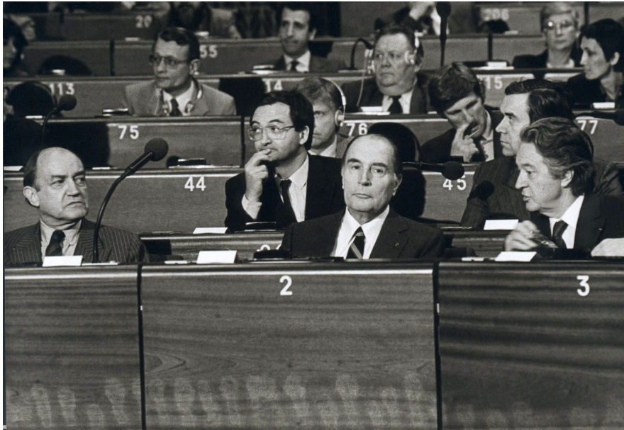
As European and foreign minister Roland Dumas (right) promoted the deepening of European integration – here with French President François Mitterrand in the European Parliament on 24 May 1984.