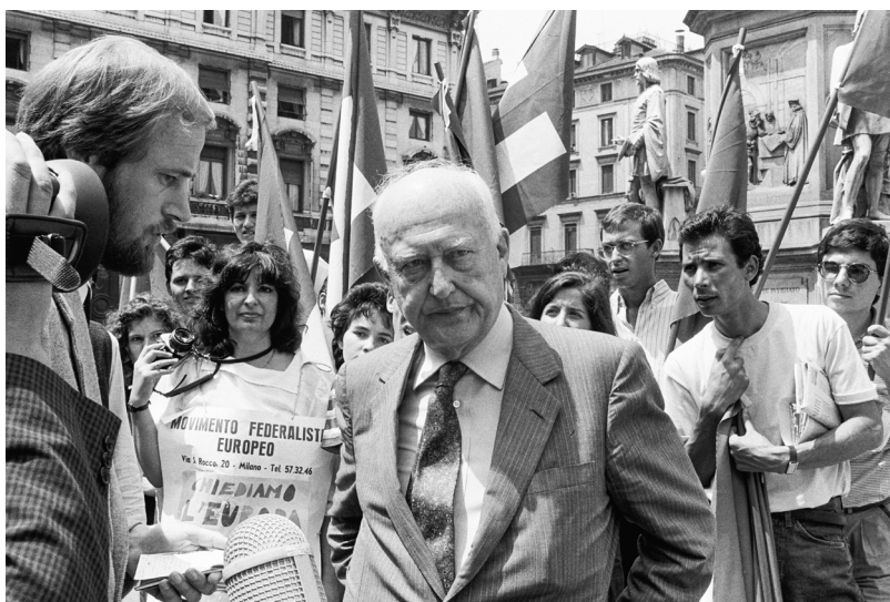
Pierre Pflimlin, President of the European Parliament, being interviewed at the Milan summit in 1985 where he lobbied the European Community heads of government and state to adopt key elements of the Draft Treaty on European Union for institutional reform.

In contrast, Hallstein's federalist political objectives and language only disguised the Commission's dominant functionalist vision of the EC's future in the most superficial way. The functionalist approach was steeped in traditions of what Wolfram Kaiser and Johan Schot have termed 'technocratic internationalism', which was pervasive in international organizations since the mid-nineteenth century. This form of internationalism was in essence based on the notion that experts with relevant knowledge were best placed to deliberate transnational policy issues and find common technical solutions to them without the interference of elected parliaments and governments, let alone diplomats in foreign ministries who perpetuated national rivalries. 282 Although he was a generalist himself, Monnet's thinking was closely connected to this tradition. His original plan for the ECSC did not even envisage a parliament. It built instead on the notion of a High Authority run by independent individuals who would be able to take binding decisions. 283