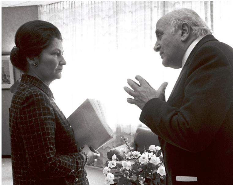
Altiero Spinelli in conversation with Simone Veil, the first President of the directly elected European Parliament, after the submission of the Crocodile Club resolution to her on 10 February 1981.

of a constitution for the EC was 'a dream, and we need dreams in Europe, but we all know that it has absolutely no chance if we suggest it now'. 78